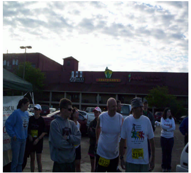
Relaxing at the Strider Hospitality Tent Race for the Cure.